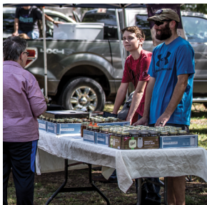
A day at the Farmer's Market